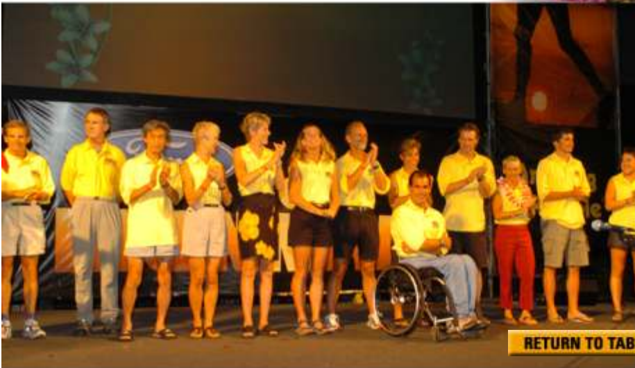
The returning Age Group Champions...