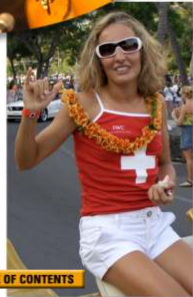
Switzerland's Natascha Badmann is once again the defending Ironman champion