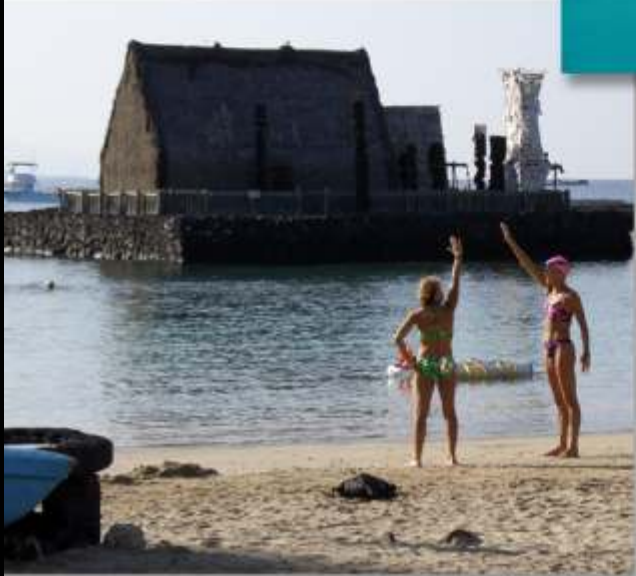
Some early morning exercise in front of the ancient Ahuena at the King Kamehameha Kona Beach Hotel.