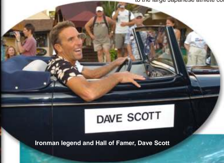
Ironman legend and Hall of Famer, Dave Scott